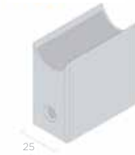
TYPE B 50x25