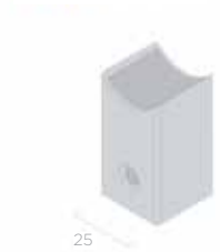
TYPE C 25x25