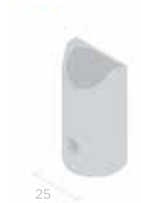
TYPE A 25 Diam